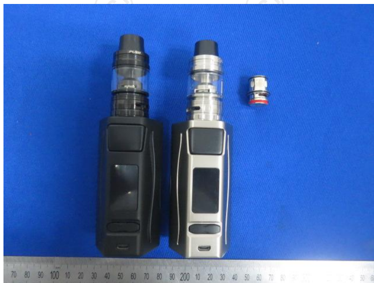
Genie PD270+Captain S KIT with NI80/0.3Ohm, NI80/0.25Ohm, NI80