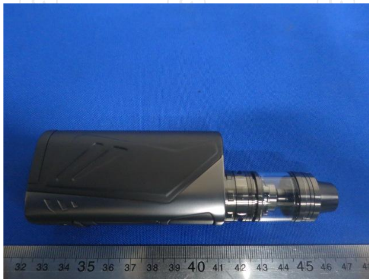
ELITE PS217 KIT