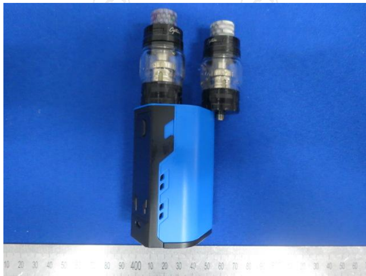
IJOY CAPTAIN X3 KIT with X3-C3 0.2Ohm/X3-C1 0.4Ohm