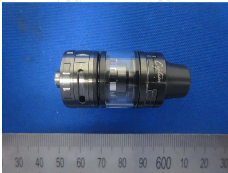
Captain PD1865+Captain MINI KIT