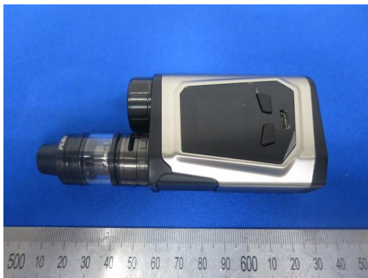
CAPO 100+Captain MINI KIT